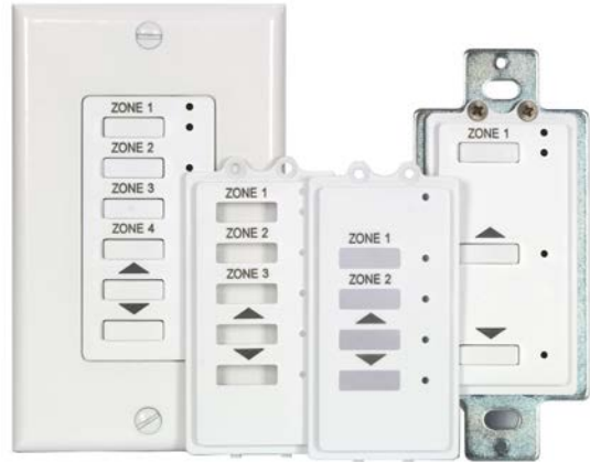
Available in White, Ivory and Gray